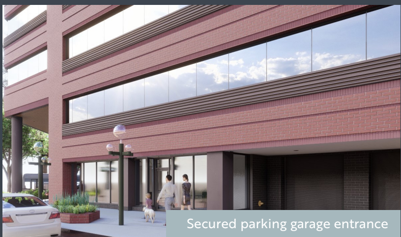
Secured parking garage entrance

Renovations now in process to be completed in November 2024