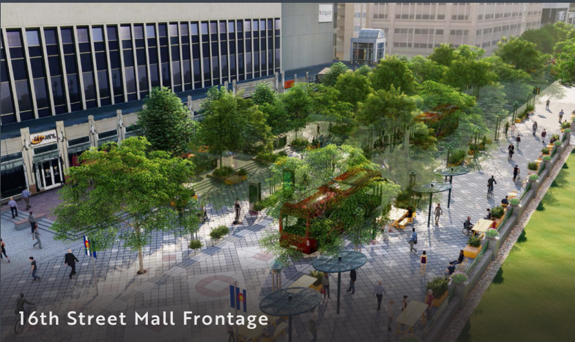
16th Street Mall Frontage