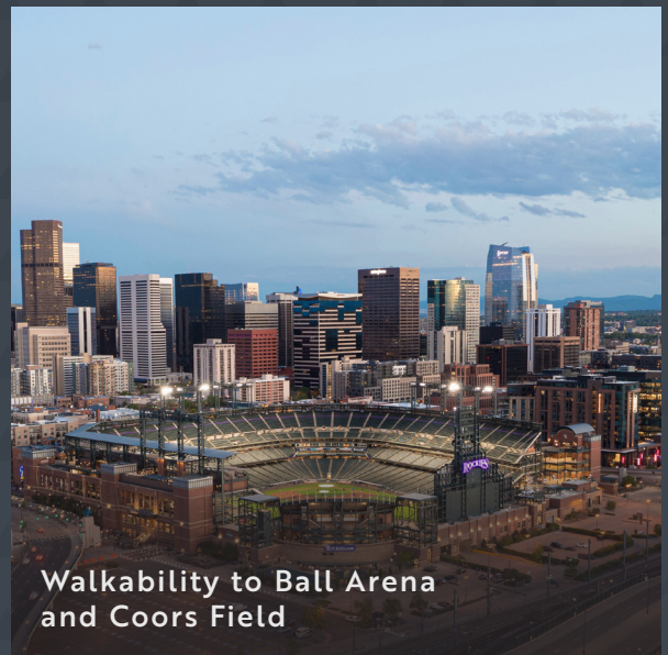
Walkability to Ball Arena and Coors Field