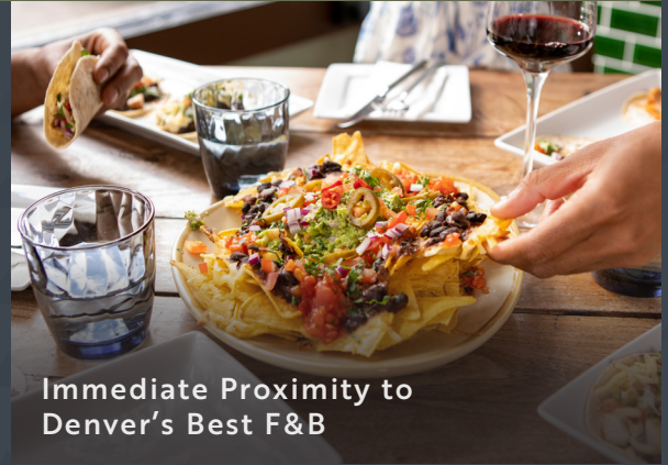
Immediate Proximity to Denver's Best F&B