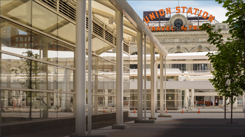
Two Blocks to Denver Union Station