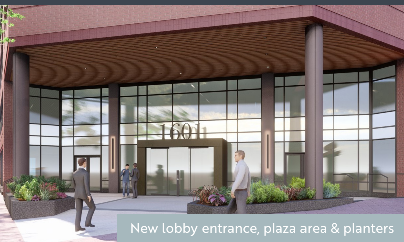
New lobby entrance, plaza area & planters